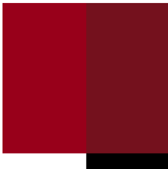
Masstone Alkyd / Melamine